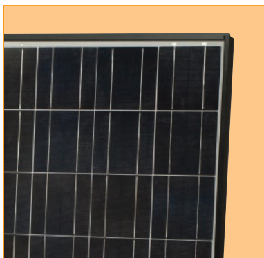
Special side flanges mount easily and securely to Sharp's innovative new racking system