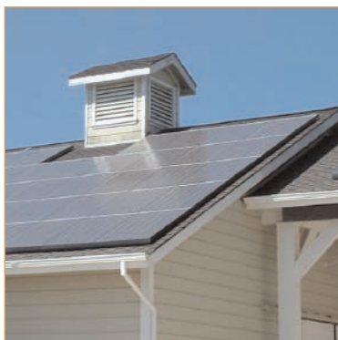
Sharp multi-purpose modules offer outstanding performance for a variety of applications.